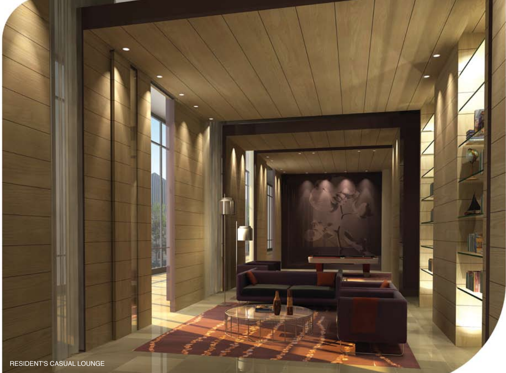
RESIDENT'S CASUAL LOUNGE