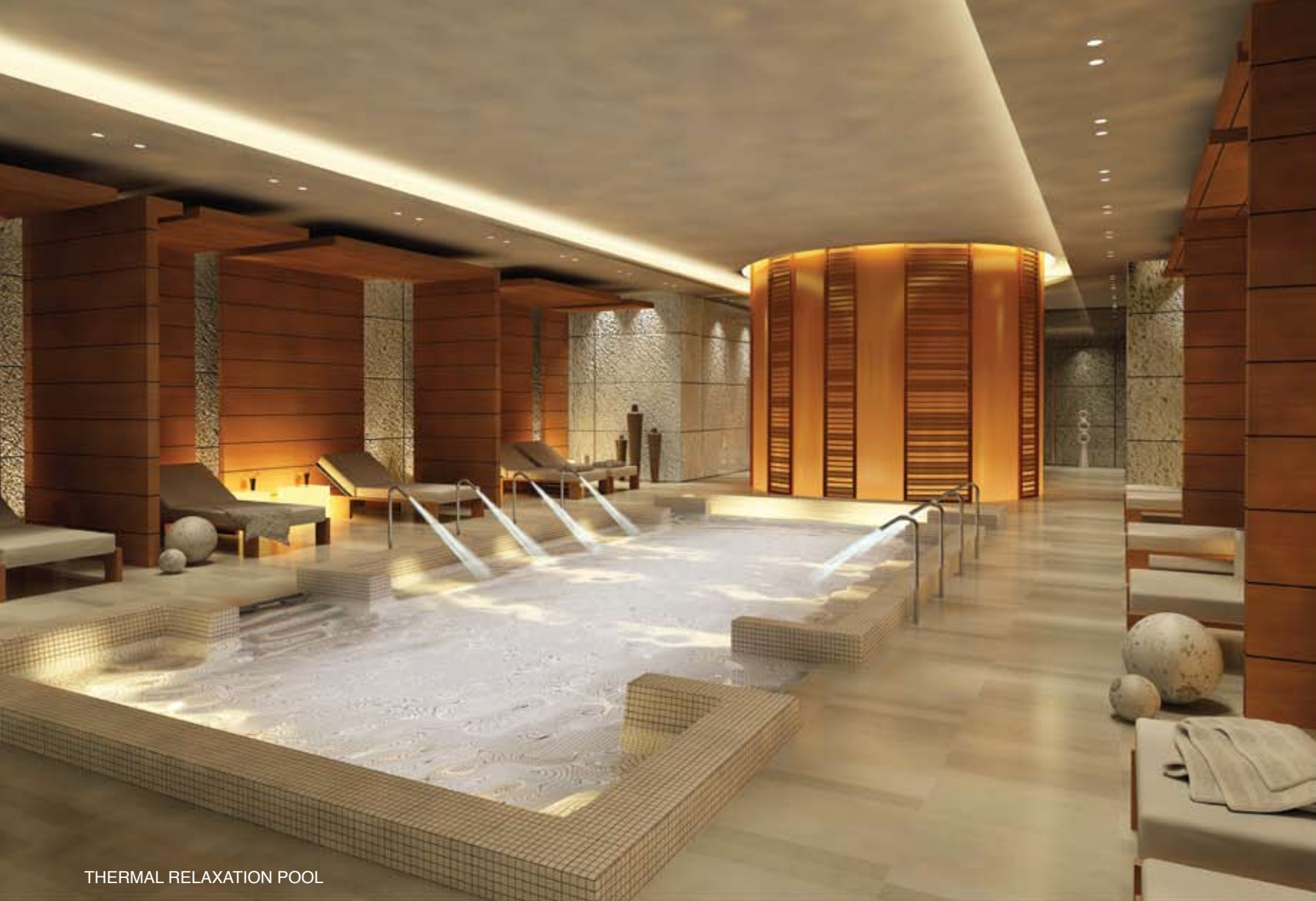
THERMAL RELAXATION POOL